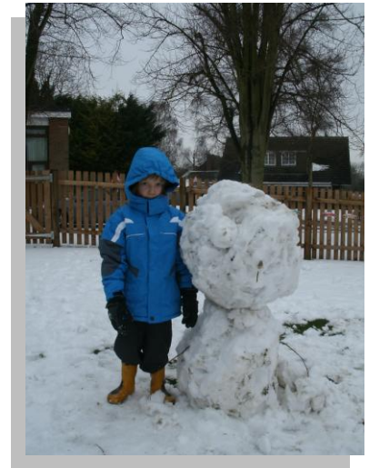
Enjoying the snow!