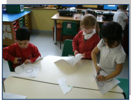
Making snowmen and snowflakes