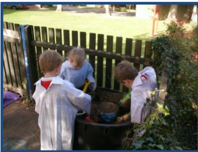
Digging for treasure!

Our favourite learning has been making musical instruments